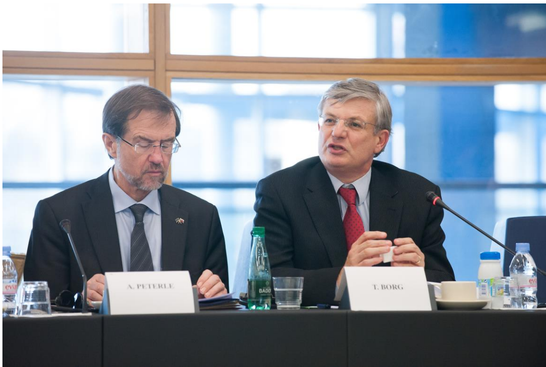
EC Commissioner for Health Tonio Borg (Right), speaking at the Launch of the European Cancer Patient’s Bill of Rights. Sitting beside him on the platform is Alojz Peterle, President of the MEPs against Cancer Group

Speaking at the Launch, Commissioner Tonio Borg welcomed the Bill of Rights, assuring those present that “cancer is very high on the Commission’s agenda” . He highlighted how the Bill of Rights’ “emphasis on optimal and timely access to specialised care” has particular resonance with the “EC Directive in Cross Border Healthcare which entered into force in October of last year and sets out citizens’ rights to go to another EU country for treatment and to obtain reimbursement for such treatment.” He also praised the “very first right that the Bill defends, the right for the patient to receive accurate information and to be actively associated in their care,” acknowledging that “Information is key to enable the patient to play an active role in his or her treatment rather than just being a passive recipient.” Overall, the principles of the Bill of Rights very much echo the commitment of the Commissioner’s action in promoting equity and combating discrimination.